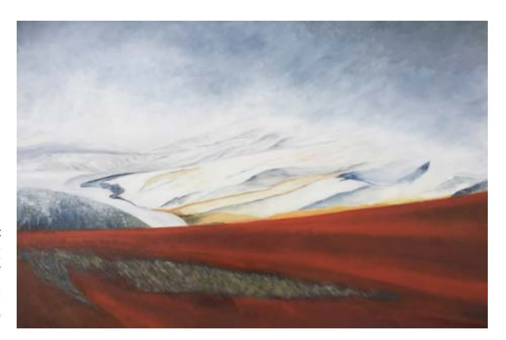
Vivian East FIRST SNOW IN THE VALLEY 24 x 36 in, Oil 2022