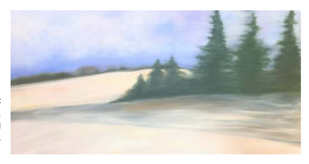
Vivian East SNOWY FIELDS I 5 x 30 in, Oil 2022