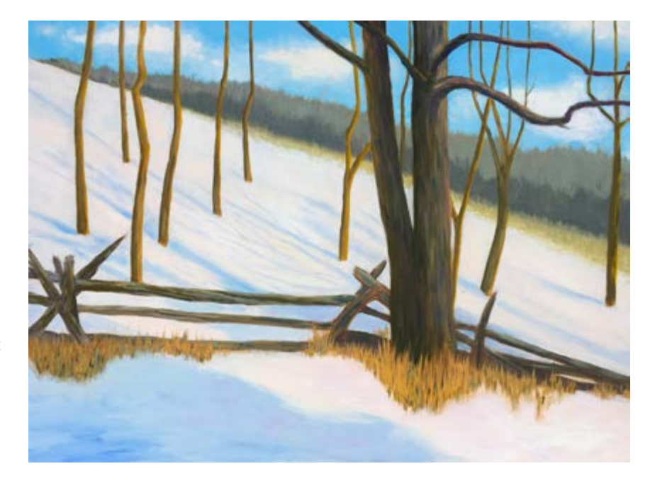
Vivian East WINTER AFTERNOON I2 x I8 in, Pastel 2023