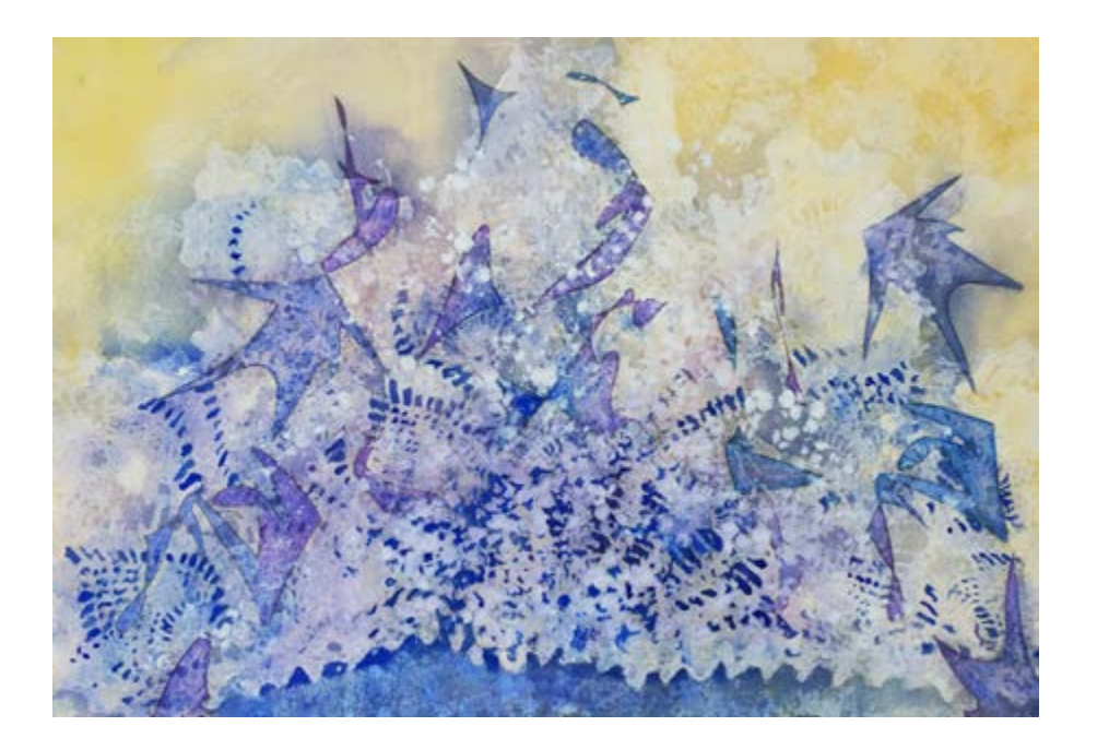
Vivian East WINTER DANCE 15 x 22 in, Mixed Media 2023