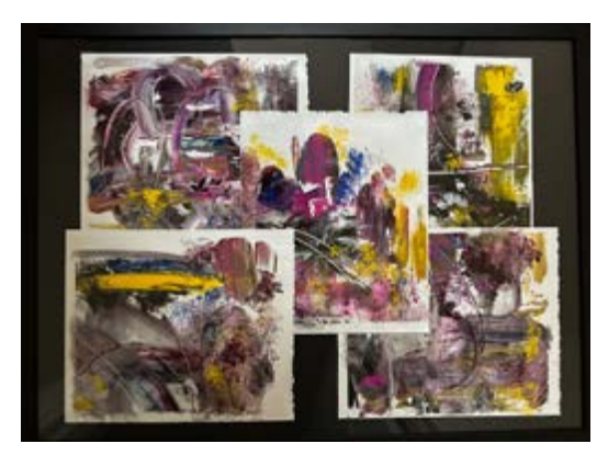
Lucie Collins BUILDING LAYERS / FUCSHIA SURPRISE 21 X 31 in, Acrylic