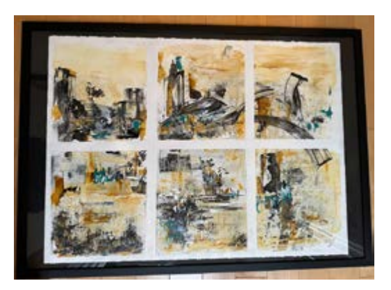
Lucie Collins A TOUCH OF TURQUOISE 24.625 x 34.625 in, Acrylic 2023